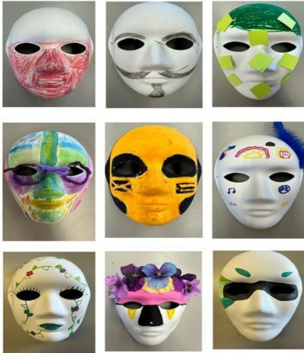
Figure 3. Masks completed by students.

Based on survey results, the students recommended offering fine arts courses, as well as courses on a variety of different subjects (e.g., computer science, web design, game studies) in the future. Students from both summer programs reported being satisfied with the student mentorship, which is consistent with other studies highlighting the crucial role of mentors in students' post-secondary success (Locke et al. , 2023).